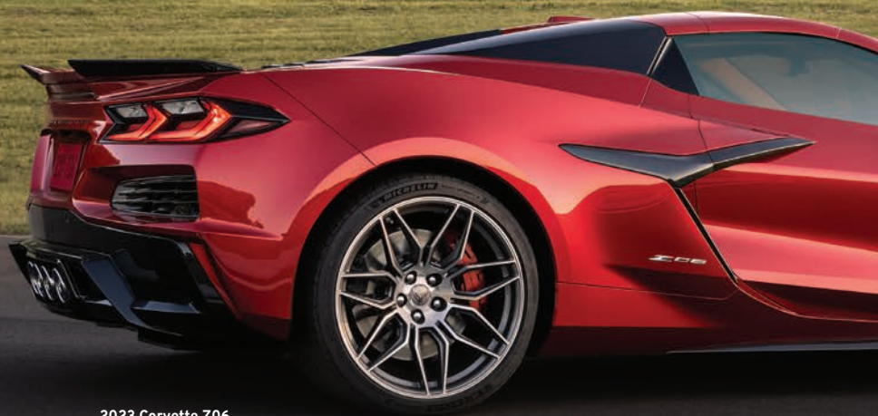
2023 Corvette Z06

12 GM GENUINE PARTS OE components work to steer customers straight