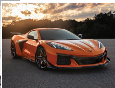
Z07 Performance Package

* Do not use summer-only tires in winter conditions, as it would adversely affect vehicle safety, performance and durability. Use only GM-approved tire and wheel combinations. Unapproved combinations may change the vehicle's performance characteristics. For important tire and wheel information, go to your Owner's Manual or see your dealer.