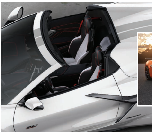
70th Anniversary Edition

Z06 owners can take their driving experience to the next level with a couple of option packages. The Z07 Performance Package offers standard carbon ceramic brakes and Michelin Pilot Sport Cup 2 tires (summer-only),* and owners can opt for available carbon-fiber wheels for unsprung weight savings of 41 pounds. Corvette's 70th Anniversary Edition is also available on the Z06, complete with unique Ceramic White Leather and red stitching, Red Stripe wheels and 70th Anniversary badging throughout the vehicle.